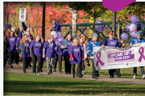
Left: On October 24, 2017 in conjunction with Child Abuse Awareness Day and #BreaktheSilence, we, along with our partners, officially opened the Waterloo Region Child and Youth Advocacy Centre (CYAC). Right: To further raise awareness, the Kitchener Rangers led a group of community champions through Victoria Park, Kitchener on #BreaktheSilence – Dress Purple Day.