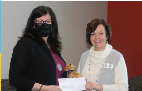
May Court Club of KW $1,000 in April 2022