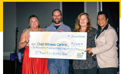
16 th Annual Elvis Birthday Show (run by Shon Carroll) $2,495 in January 2023