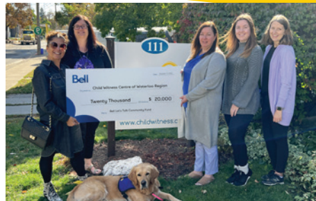
Bell Let's Talk $20,000 in October 2022