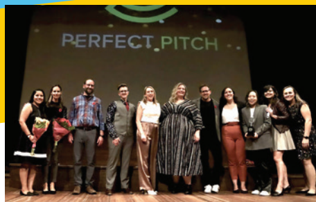
Perfect Pitch 2022 (run by Social Venture Partners WR) $4,599.27 in November 2022