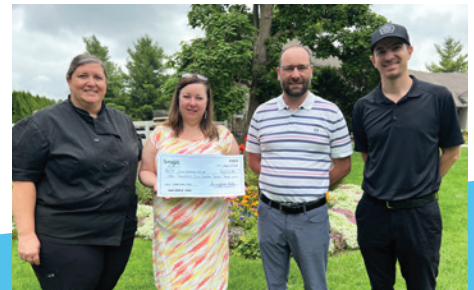
Springfield Golf Club's 2 nd Annual Charity Tournament $10,523.80 in July 2022