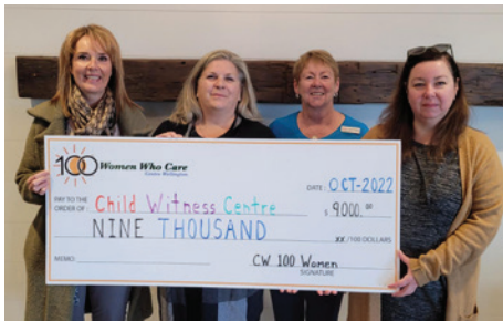
100 Women Who Care – CW $9,000 in October 2022