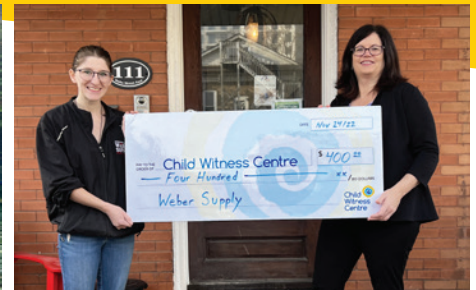
Weber Supply $400 in November 2022