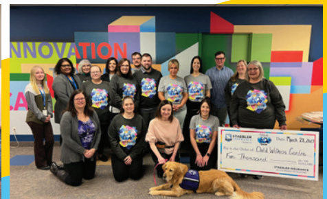
Staebler Insurance $5,000 in March 2023