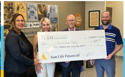
T.E.A.M. Financial Solutions $464 in September 2022