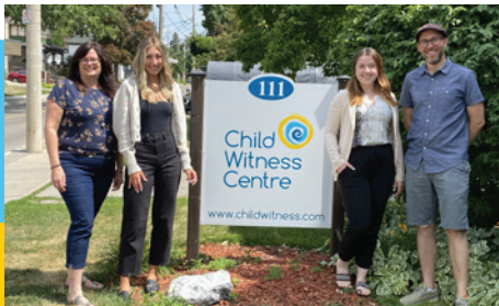
Canada Summer Jobs Summer 2022

Thank you to all our awesome volunteers for generously offering your time and talents to support our mission. Your willingness to give of your resources and expertise is greatly appreciated. With reduced staffing, we relied more heavily on volunteers through student placements, co-op programs, and the Canada Summer Jobs program.