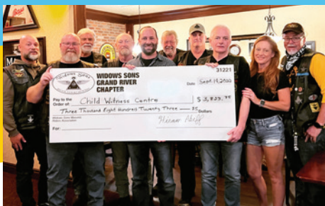
Widows Sons Grand River Chapter's 2 nd Annual Charity Ride $3,823.75 in August 2022