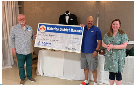
Waterloo District Masonic Golf Tournament 2022 $4,800 in May 2022