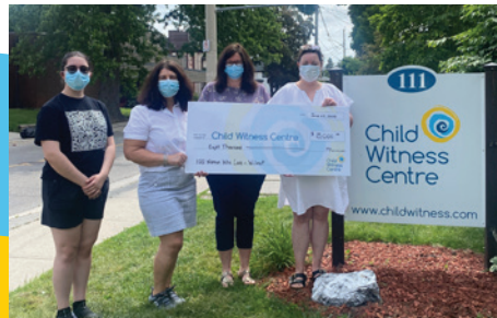
100 Women Who Care – Wilmot $8,000 in June 2022