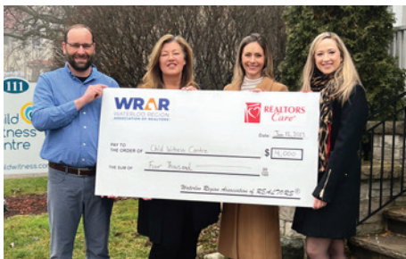
WRAR (Realtors Care) $4,000 in January 2023