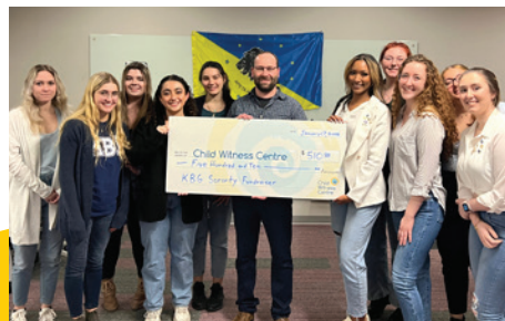
KBG Sorority $510 in January 2023