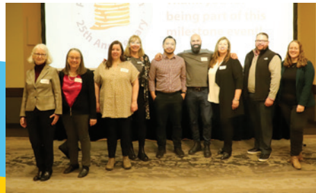
Board Members at Pancake Lunch February 2023